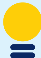
Fairness of outcomes 共享成果