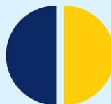
Explore how 21st-century philanthropies could evolve in Asia and beyond 探討21世紀慈善事業在亞洲及 其他地區的發展路向