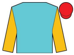
SING US A SONG