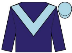
SEE THE FIRE