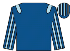
SOUS LA NEIGE