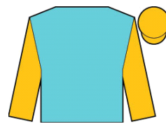
MAKE ME KING