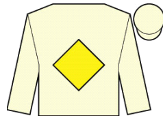
CATCH THE PADDY