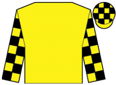
THE X O