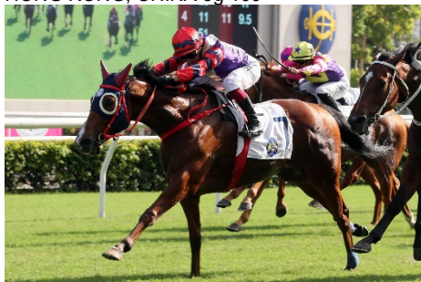
HAPPY TOGETHER (IRE) HONG KONG, CHINA 5g 109