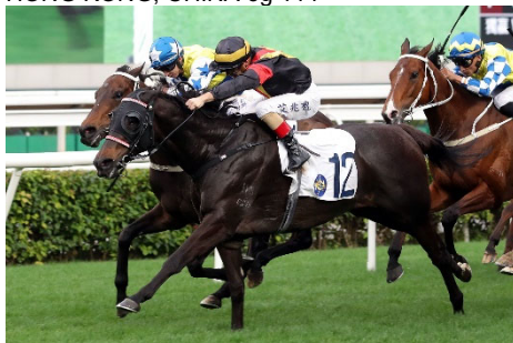
NIMBLE NIMBUS (NZ) HONG KONG, CHINA 6g 114