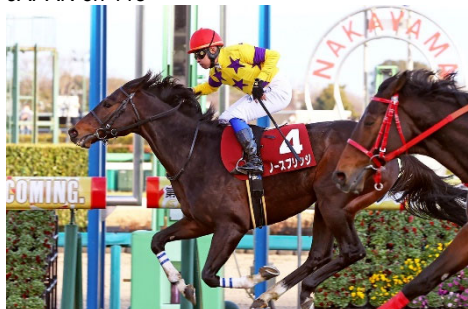
NORTH BRIDGE (JPN) JAPAN 6h 113