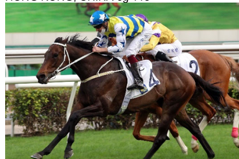
FIVE G PATCH (IRE) HONG KONG, CHINA 6g 113