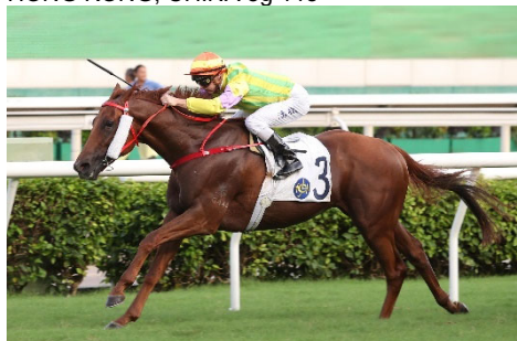
SWORD POINT (AUS) HONG KONG, CHINA 5g 115