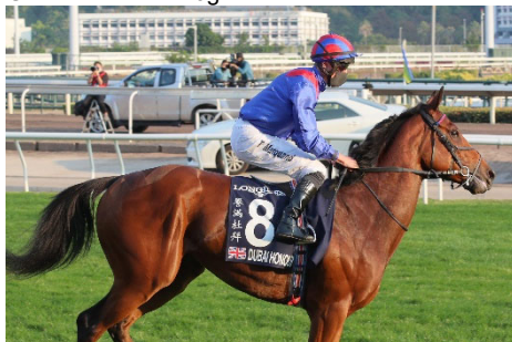
DUBAI HONOUR (IRE) GREAT BRITAIN 6g 121