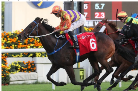
STRAIGHT ARRON (AUS) HONG KONG, CHINA 5g 118