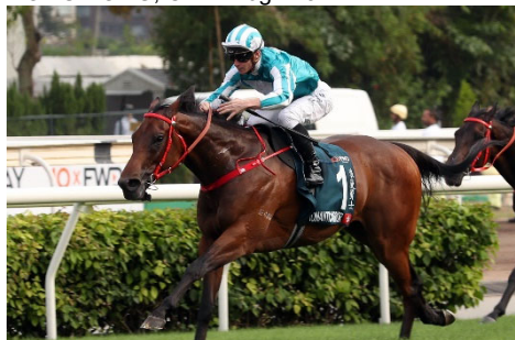
ROMANTIC WARRIOR (IRE) HONG KONG, CHINA 6g 123