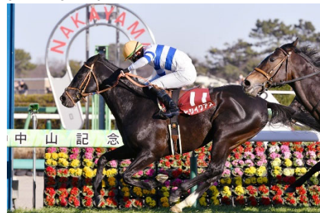
HISHI IGUAZU (JPN) JAPAN 8h 119